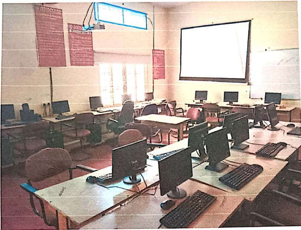
LAB WITH LCD PROJECTOR